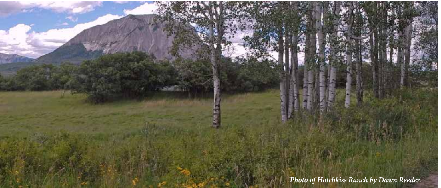
Photo of Hotchkiss Ranch