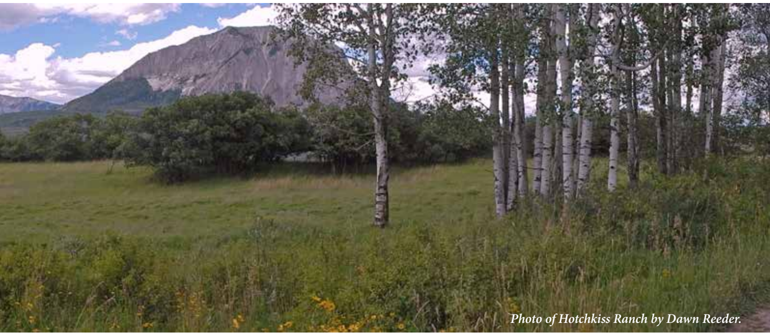
Photo of Hotchkiss Ranch