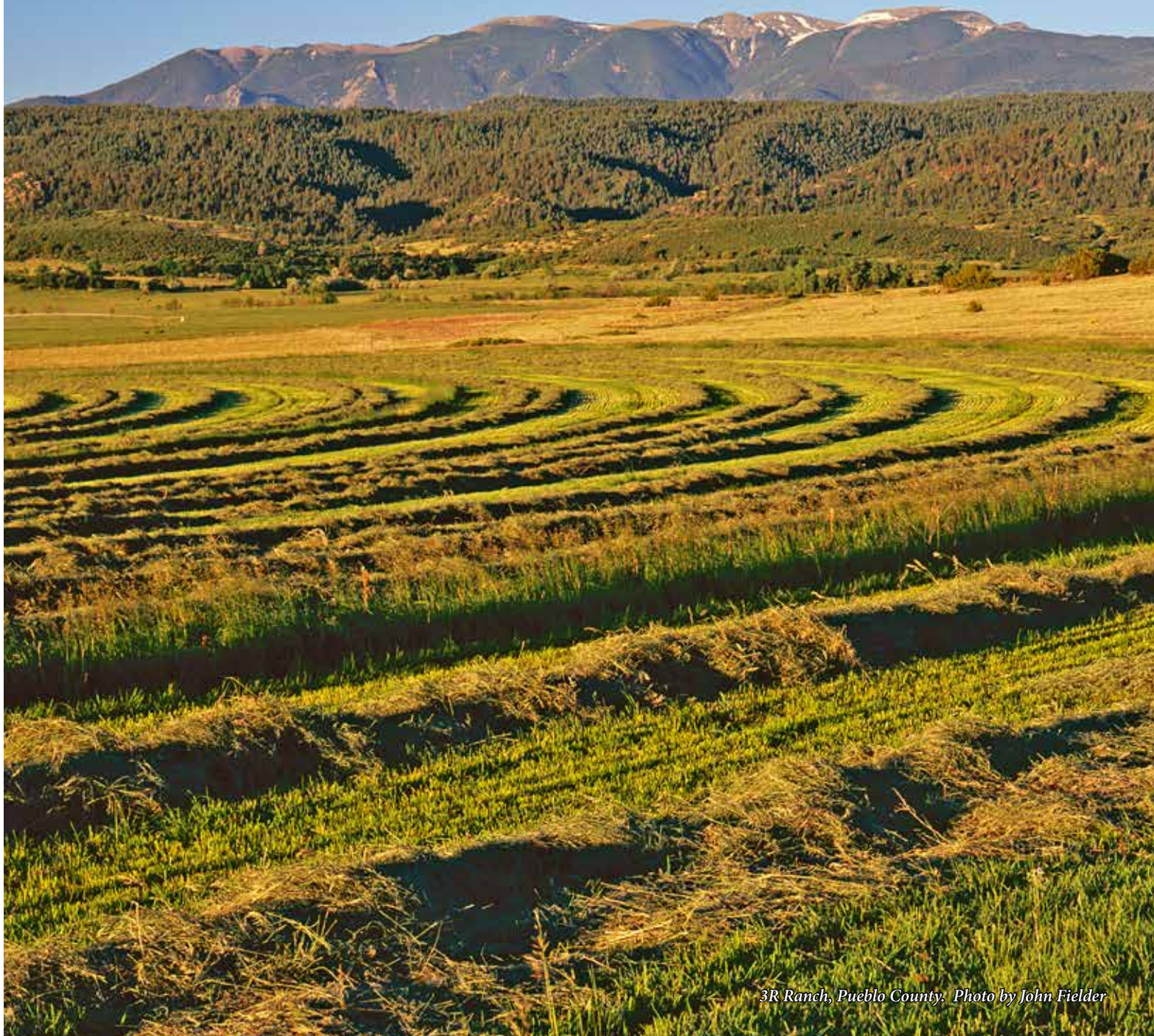
3R Ranch, Pueblo County.