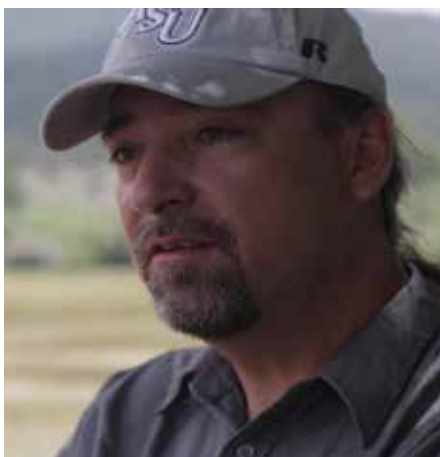
Riverview Farms, Weld County

“My family has been here for over 100 years; it’s home. We entered into this agreement with Colorado Open Lands to preserve this property and it’s been great. Just knowing that someday when I leave this earth, I know the land will remain the same, it gives me peace.”