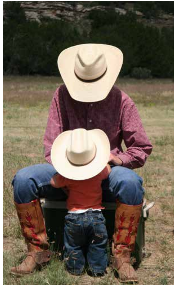
Beatty Canyon Ranch, Las Animas County.

In rare cases, Colorado Open Lands may be able to raise funds through various grant programs to pay for a portion of the value of your conservation easement. These funding programs are highly competitive and different funding sources may require particular restrictions in a conservation easement. COL will work with you to determine if your property qualifies for available funding programs. Even when we can raise funds for a conservation easement, a certain percentage of the value of the conservation easement is typically donated. You may then be eligible for tax benefits, based on the donated value of the conservation easement. This is known as a bargain sale. The bargain sale of a conservation easement is usually at least a three-year process.