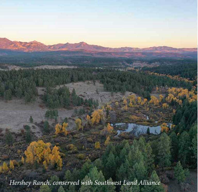
Hershey Ranch, conserved with Southwest Land Alliance