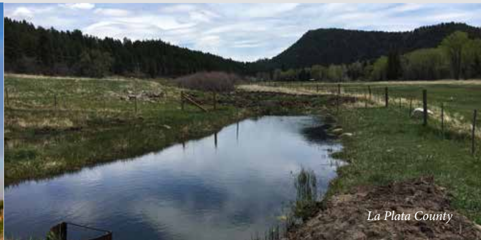
La Plata County