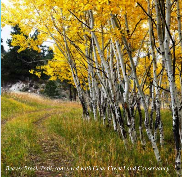
Beaver Brook Trail, conserved with Clear Creek Land Conservancy